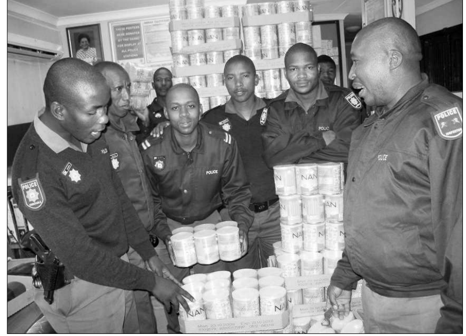
were involved in getting to the criminals